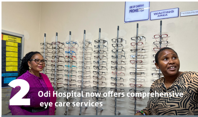
2 Odi Hospital now offers comprehensive eye care services