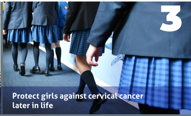
3 Protect girls against cervical cancer later in life