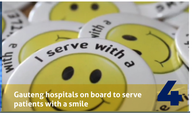
4 Gauteng hospitals on board to serve patients with a smile